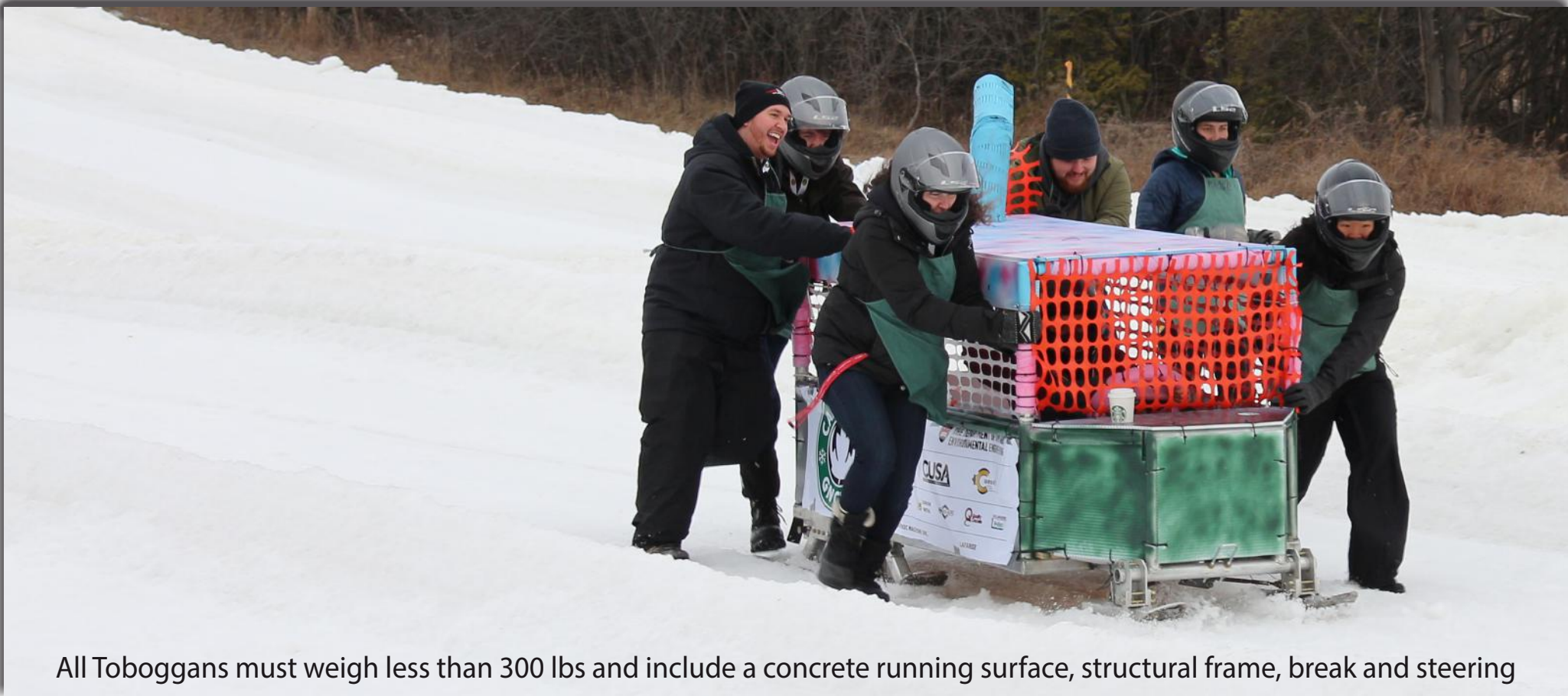
All Toboggans must weigh less than 300 lbs and include a concrete running surface, structural frame, break and steering

During the competition the toboggans are evaluated on their design and performance in a variety of categories including concrete mix design, braking system, steering system, sustainability, and performance. Teams are also judged on their project report, presentations, sportsmanship, and spirit.